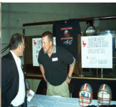
You will buy a helmet—and like it!!!